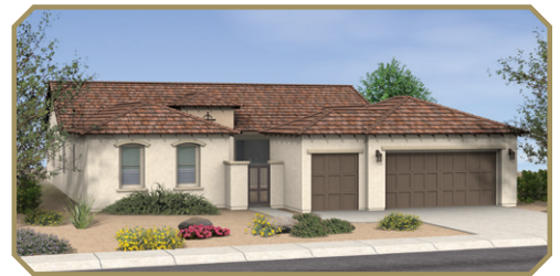
Exterior Design B