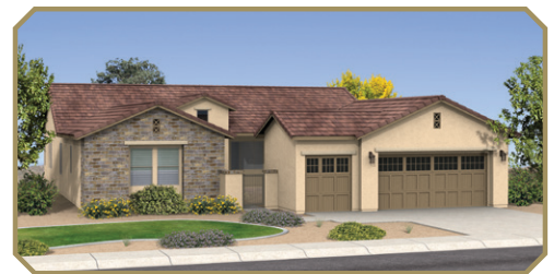
Exterior Design C