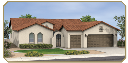
Exterior Design A

Standard Livable Space Optional Livable Space Standard Concrete Areas Optional Concrete Areas