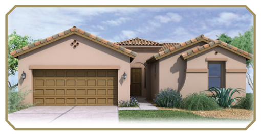
Exterior Design B