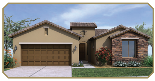
Exterior Design C

Information subject to change without notice. We reserve the right to discontinue or change specifications at any time and any prospective buyer is aware that any promotional materials that have been viewed may have extra features or improvements shown therein, which may not be included unless specifically provided for in the purchase contract. All measurements in model homes may vary slightly without incurring any obligation. Check with your New Home Consultant. The housing at any Robson Resort Community is intended for occupancy by at least one person 55 years of age or older per unit, although the occupants of a limited number of the dwelling units may be younger. One person must be at least 40 years of age in each unit. No one in permanent residence under 19 years of age. Homes are offered and sold by SaddleBrooke Development Co. owner/agent. SaddleBrooke Construction Company, general contractor, RCC 192901. Effective date 1/1/12. Robson Communities, Inc.