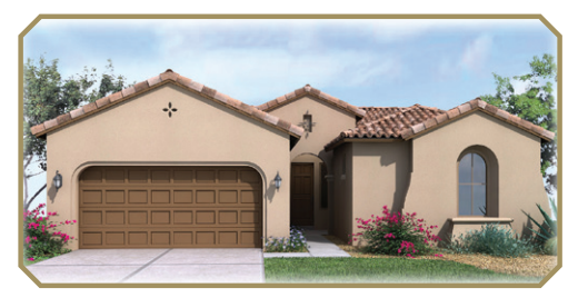
Exterior Design A