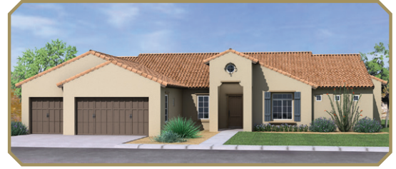
Exterior Design A

Standard Livable Space Optional Livable Space Standard Concrete Areas Optional Concrete Areas