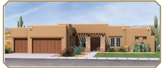
Exterior Design B