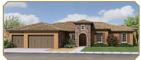
Exterior Design C