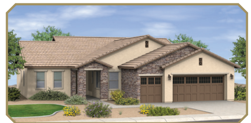
Exterior Design C