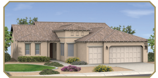
Exterior Design B