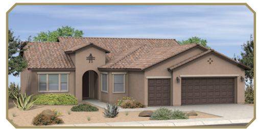
Exterior Design A